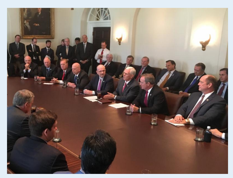
In a photo taken on March 23, not a single woman was pictured in a roomful of lawmakers discussing health care reform, including possible changes to women's health services. We have seen this many times before.